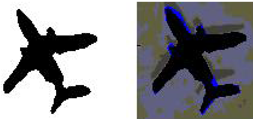
Fig. 3. Measurement of aircraft area for a filter mask n = 5 and conversion threshold \theta = 0,6 (left), and an imposition of the image area (left) to the real aircraft image (right)

of averaging of the adjacent pixels brightness by median filter (Fig. 3, right). Due to this fact the analysis (aircraft area measurement) remains within acceptable accuracy. The increasing of the complexity of image processing and analysis method (9) by methods of image restoration and morphological analysis allows to minimize the number of "false" pixels in the object of interest and refine a model of the object of interest (Fig. 3, left).